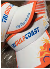
The TGC (White)