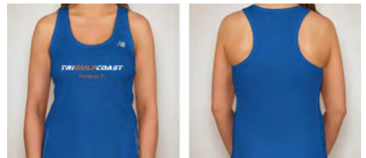
TGC Runner (Blue)