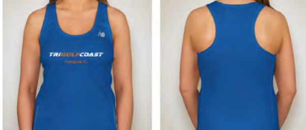
Women's TGC Runner Blue New Balance Running Singlet