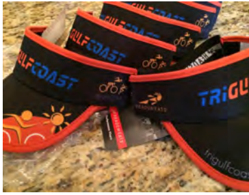
The TCG (Black)