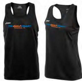
TGC Runner (Black)