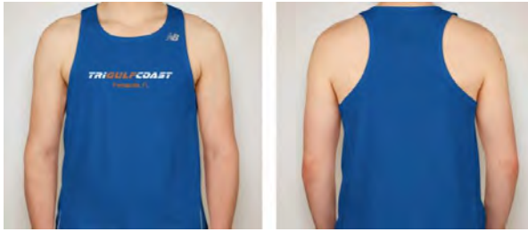
Men's TGC Runner Blue New Balance Running Singlet