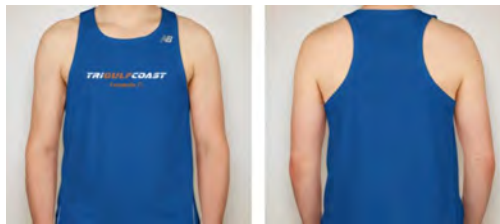
TGC Runner (Blue)